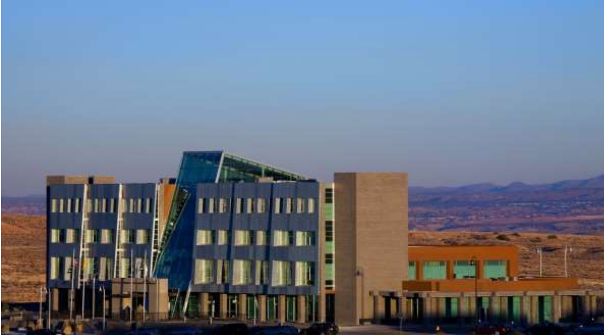
Rio Rancho City Hall

The City of Rio Rancho was incorporated in 1981 and adopted a municipal charter as a “home rule” City in 1991. A municipal charter grants the City broad power of self-government under the state of New Mexico constitution. The City may specify its form of government and enact ordinances to address land use, and it may adopt its own procurement code. The Charter also establishes the office of the City Manager, City Attorney, and the City Clerk. The Charter establishes the Municipal Court and the Municipal Judge. The Charter establishes boards and commissions, such as the Planning and Zoning Commission, the Utilities Commission, Parks and Recreation Board, and Capital Improvement Plan Citizens Advisory Committee.